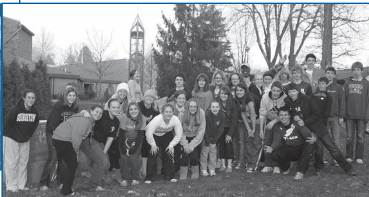
St. Barnabas Students "Cardboard Campout"